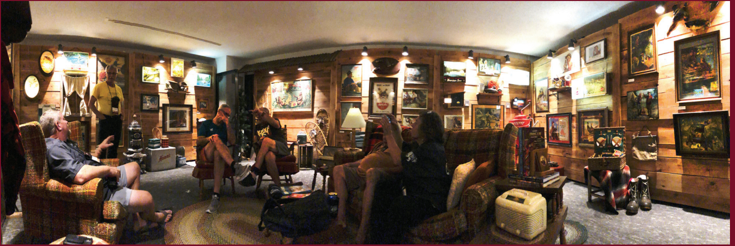
A panoramic shot of a hotel suite stunningly transformed into an experiential breweriana exhibit.