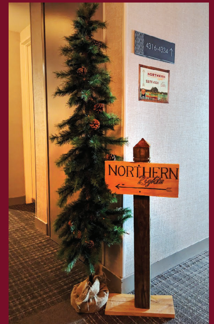
The rustic directional signs placed on the floor surrounding the suite signaled to convention goers that the “Northern Lights” exhibit was open for business.