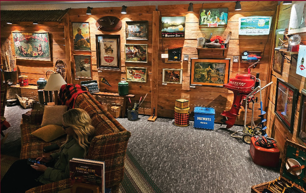
Above: Breweriana featuring hunting, fishing and camping scenes were at home in the “cabin.” Beyond the ample displays of point-of-purchase advertising were beer-branded premiums, like the vintage Schmidt’s bait bucket and Hamm’s cooler shown at right.