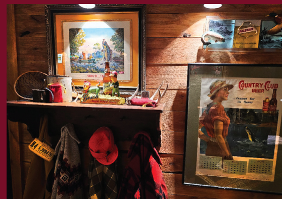
The cabin’s décor featured many of the items actually depicted in the carefully-curated period breweriana displayed in the overall exhibit.