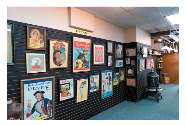
Part of Stan's 'Pretty Gals' collection on display at Cone Top Brewery Museum.