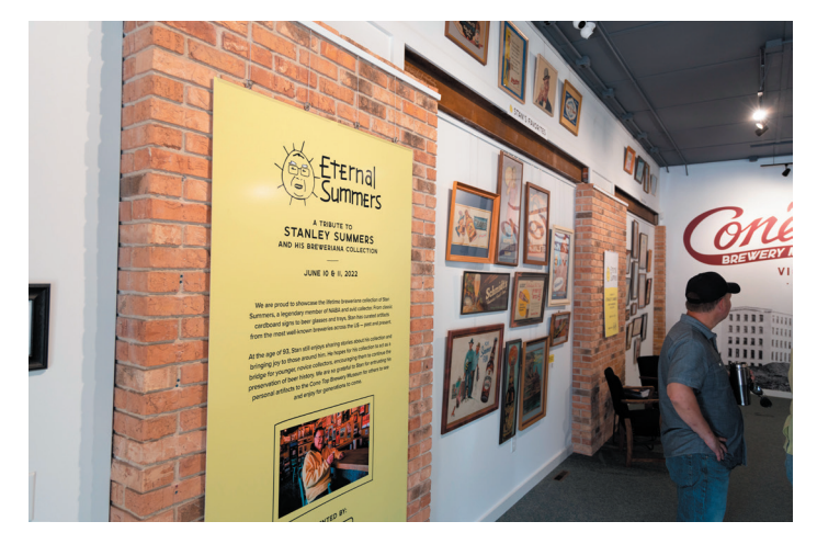
A glimpse into the Cone Top Brewery Museum and more of Stan's collection.