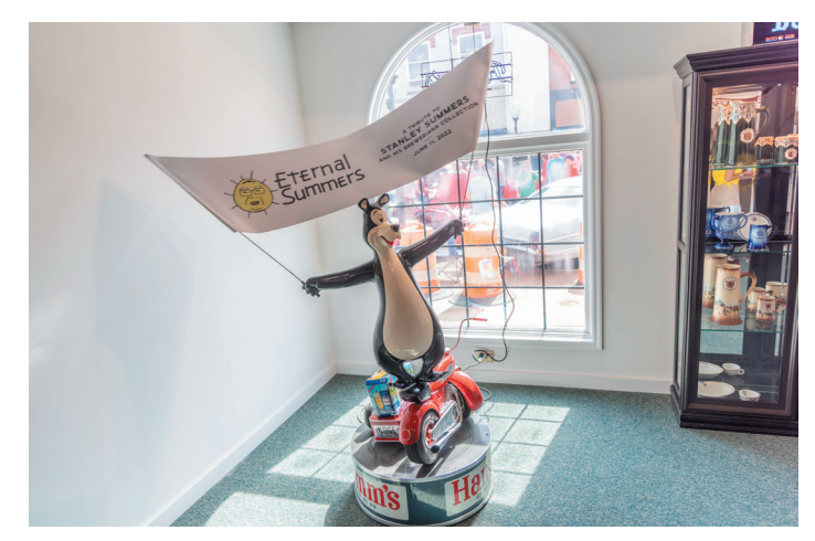
The Famous Hamm's Spinning Bear, fully operational, waving the Stanley Summers banner proudly!