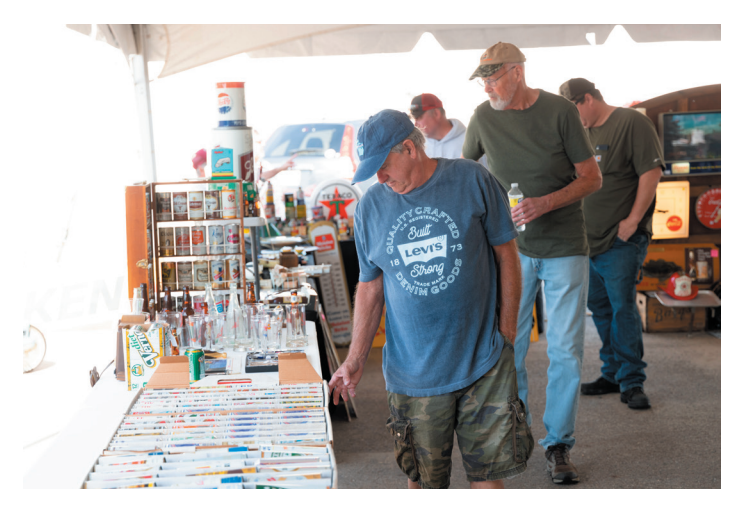
Villagers and visitors browse the tent and find items to start their own beer collections.