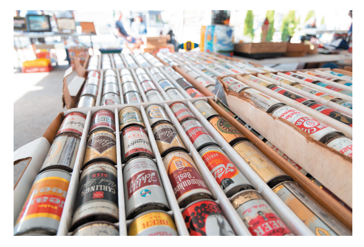
Expansive assortment of cans by collector Tom Legeret.