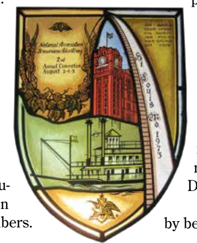
The original shield designed to commemorate the second NABA Convention (1973) held in St. Louis.

In the meantime, don't forget to make your plans to celebrate our 50th anniversary convention from July 28th-31st, 2021 in (of course) Milwaukee, WI.