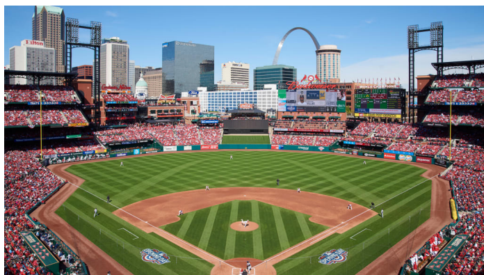
Monday night baseball will feature the St. Louis Cardinals hosting the Texas Rangers. Tickets for the NABA block of seats are limited and can be ordered only via the NABA website www.nababrew.com .

NABA has secured a block of discounted tickets which are available for purchase directly by going to our website, www.nababrew.com on a first come, first served basis. Convention registration is required to purchase tickets from the NABA block, and members will need to provide their own transportation to and from Busch Stadium.