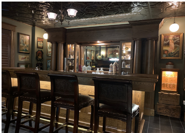
Dave Birk’s beautiful home features a remarkable collection of lithographs and etched glasses, presented in an unforgettable speakeasy setting.