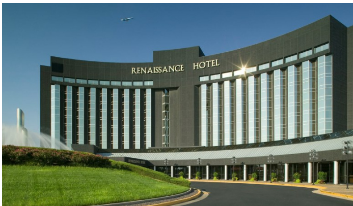
The 2024 NABA Convention will be held at the Renaissance St. Louis Airport Hotel in St. Louis, MO.